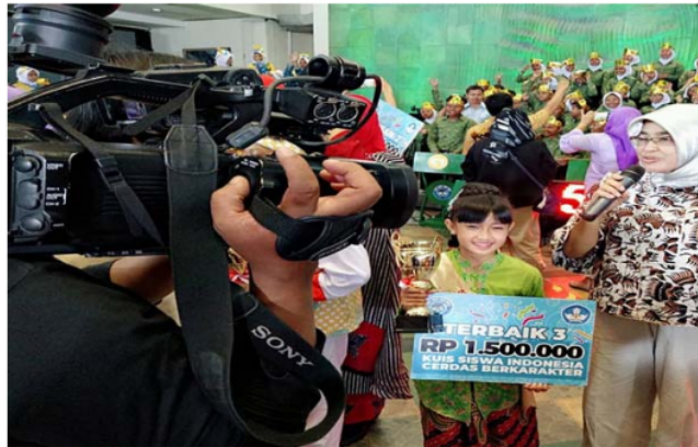
Picture 1.5 Winner Announcement