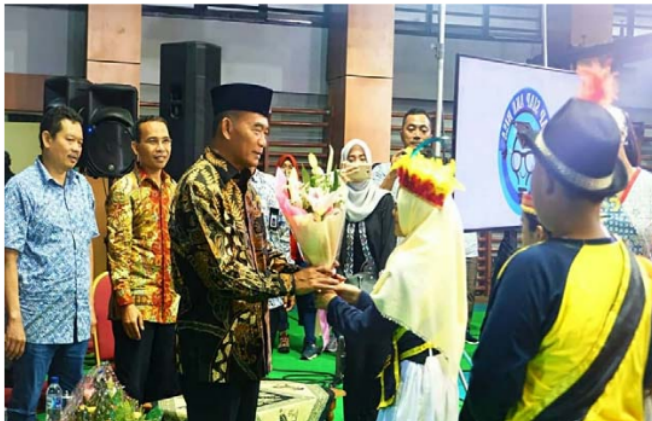
Picture 1.6 Participants with Javanese Culture