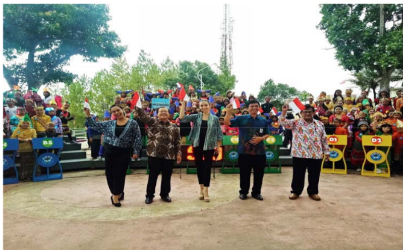
Picture 1.2 Training Session