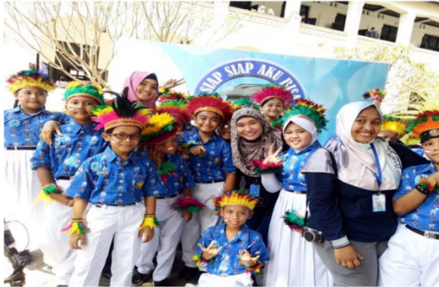
Picture 1.4 Winner announcement